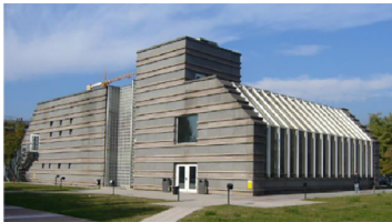
Figure 1: Smart Campus demonstrator

The case study is a two-floor classroom building, characterized by low energy efficiency. Realized in the nineties, it is located in the department of Civil and Architectural Engineering of the University of Brescia (Figure 1). The building has also an underground floor where two computer laboratories are located. A two-level glazed atrium closes the south-east side and it is used as a free study room during the day.