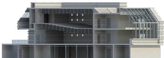
Figure 2: Architectural Building Information Model

An Asset Information Model of the building has been created - including architectural (Figure 2), structural and MEP elements - in order to digitalize the original documentation, to update it to the as-built condition and to support an energy analysis by means of a BIM-to-BEM (Building Energy Modelling) workflow (Ciribini et al, 2015). Moreover, other BIM uses have been implemented related to the operation and maintenance phases and the creation of an information base in order to support the decision-making process in case of any possible future intervention on the building.